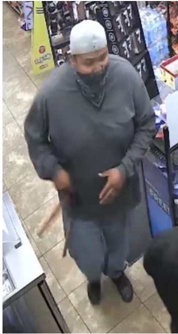
Suspect # 1