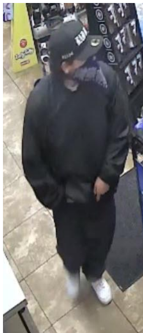
Suspect # 4