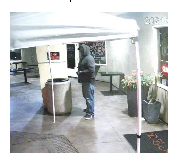
Suspect # 1