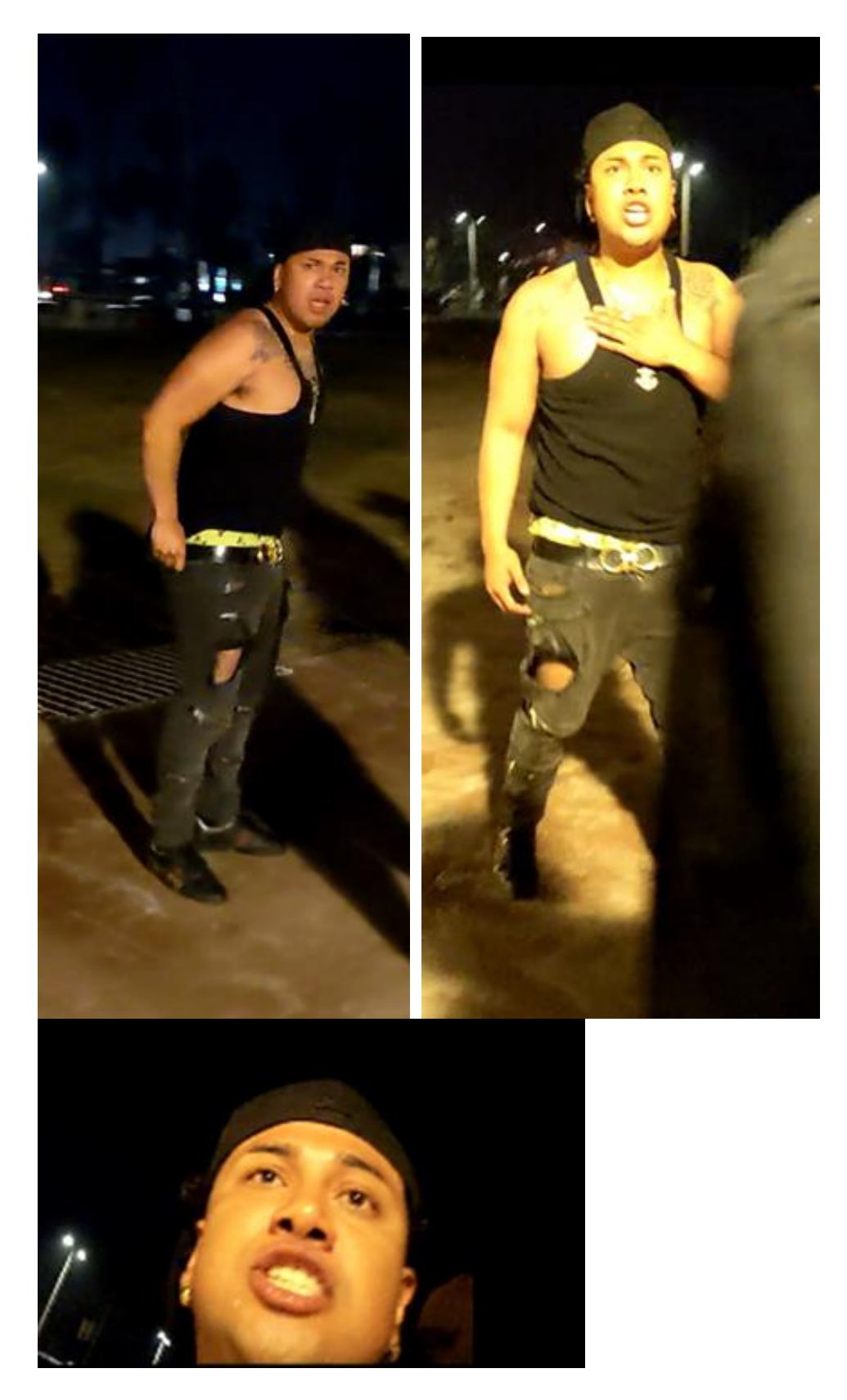
Suspect # 1

San Diego County Crime Stoppers Media Release August 3, 2021 Page 2